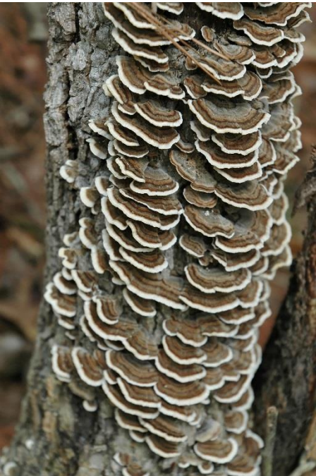
Mushrooms on trunk