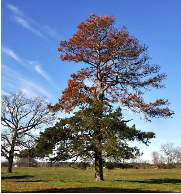
Pine attacked by engraver beetles