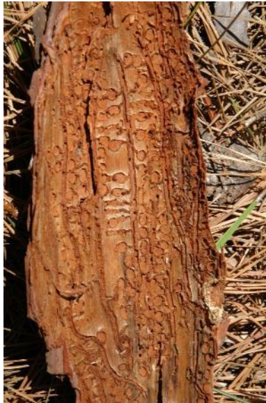
Engraver beetle galleries in loblolly pine bark