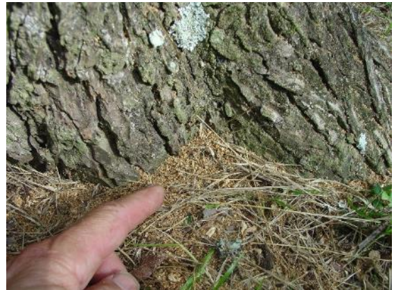
Boring dust in cedar elm