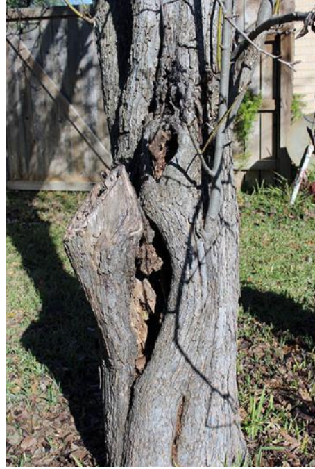
Many broken branches or severe topping