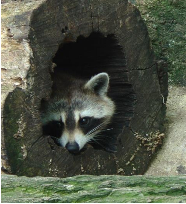
Cavities in trunks or branches