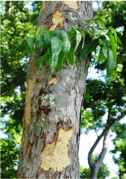
Soapberry borer infestation